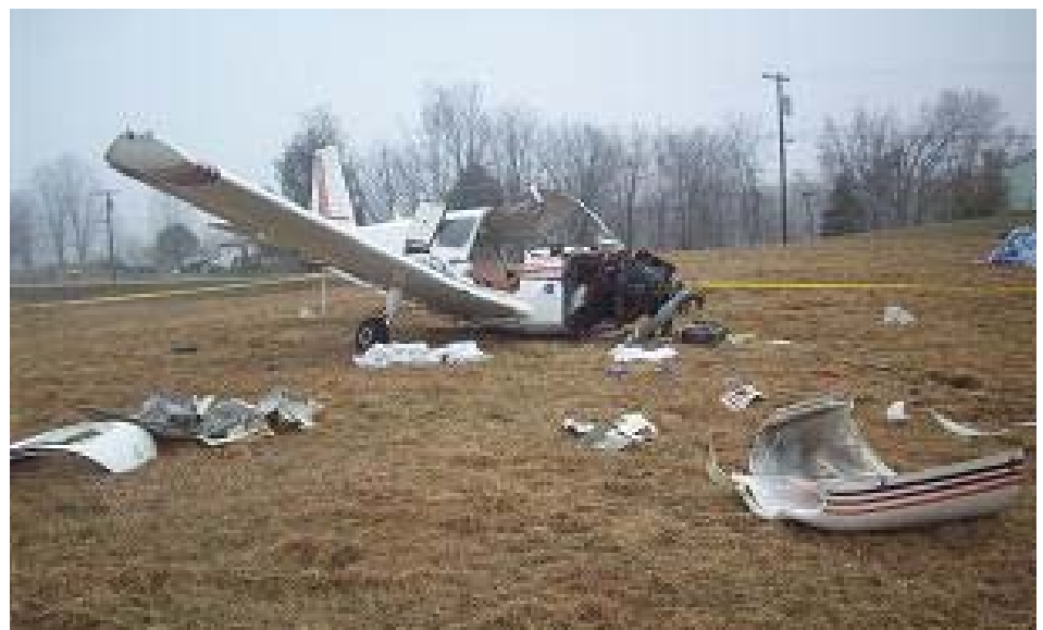
Nearly 80% of Airplane Crashes are Avoidable

General Aviation as a whole suffers from those individual stupid