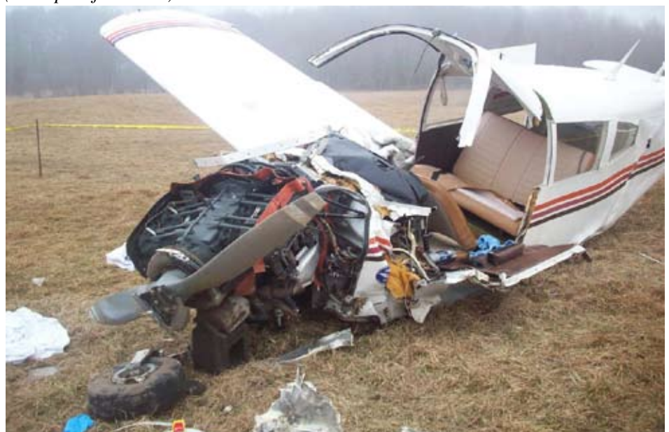
Wreckage of a Piper 180 due to fuel exhaustion