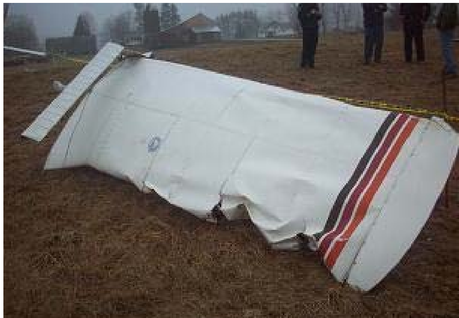
Left Wing Separated Upon Contact With Trees

JAMA Finds That Shoulder Harnesses Save Lives